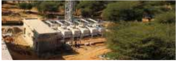
Supporting Large Infrastructure Projects