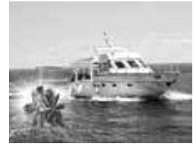
Engines of Growth